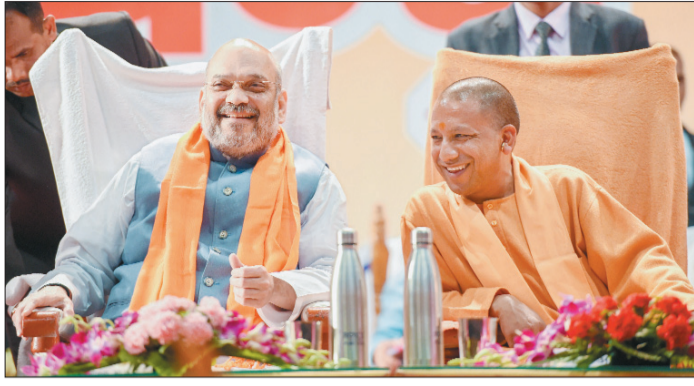
Bharatiya Janata Party National President Amit Shah with Uttar Pradesh Chief Minister Yogi Adityanath at the 'Sahakari Bandhu Sammelan', in Lucknow on Saturday.

CLAIMING that his party has strengthened the cooperatives movement in the country, BJP President Amit Shah said on Saturday the Modi Government has extended three times more help to farmers when compared to the previous UPA Government. "The previous UPA Government of Sonia Gandhi and