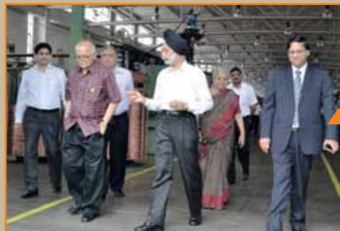
Plant visit of Independent Directors of the Company