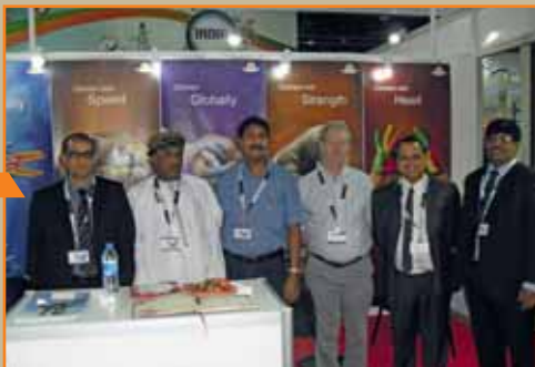
Company Participated in Gitex Technology Week 2014, held at Dubai, UAE