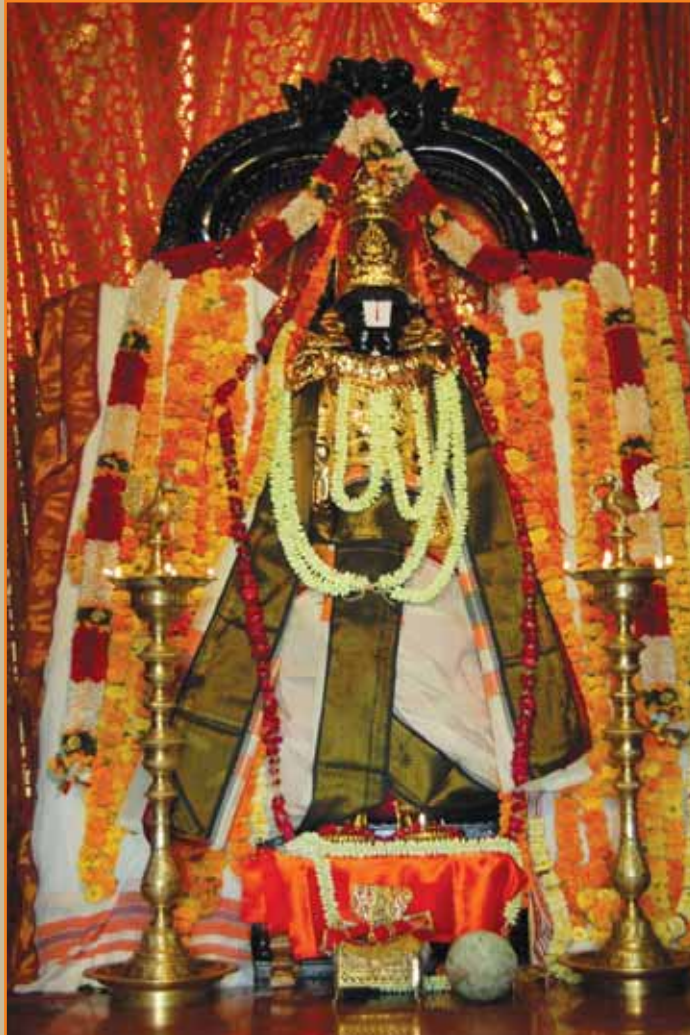
"BHAGWAN TIRUPATI BALAJI" IN THE COMPANY'S TOWNSHIP AT REWA, MADHYA PRADESH