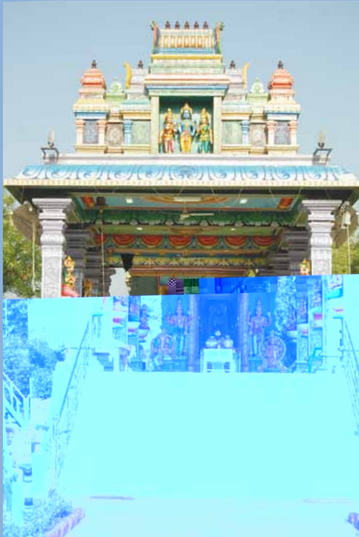
"SHRI BALAJI TEMPLE" IN THE COMPANY'S TOWNSHIP AT REWA, MADHYA PRADESH