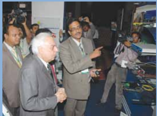
Participated in 6th Annual FTTH Council Asia-Pacific Conference & Expo 2011 at New Delhi and Honourable Union Minister for Communication & IT - Shri Kapil Sibal, visited our booth.