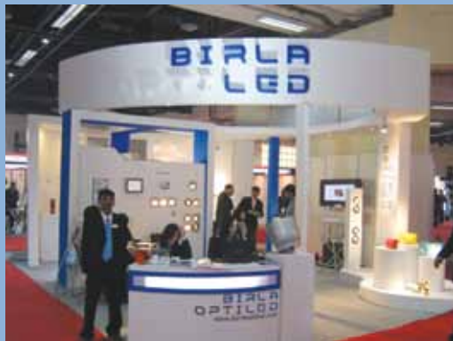
Participated in LED Expo in December 2010 at Pragati Maidan, New Delhi, under the brand name "Birla Optiled- Lighting Solutions".